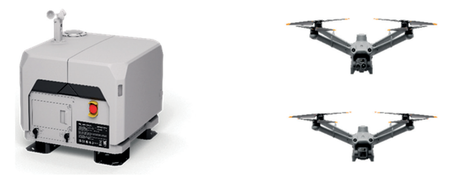
Figure 1. DJI Dock 2 and Matrice 3D/3DT [14]

DJI's dock 2 to accommodate Matrice 3D/3TD type drone versions is equipped with multiple redundancy flight control systems, six directional sensors and positioning systems, a powerful multi-camera payload and a new First Person View (FPV) camera night vision system that provides Return to Home and obstacle detection. Total weight: 1410 g (without baggage), maximum take-off weight: 1610 g, maximum flight time: 50 minutes, maximum operating altitude: 4000 m, image transmission solution: O3 Enterprise, video transmission range Federal Communications Commission (FCC): 15 km, European Conformity (CE): 8 km, State Radio Regulation of China (SRRC): 8 km, "MIC" video transmission (MIC): 8 km, wide angle camera: 1/1.32 inch, complementary metal-oxide-semiconductor (CMOS); 48 MP, telephoto camera: 1/2 inch CMOS; 12MP; 56x hybrid zoom, thermal imaging 640 x 512 @ 30 fps (Figure 1).