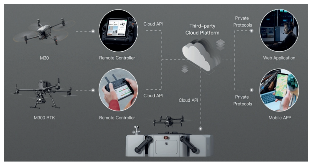
Figure 5. Low-threshold access to third-party cloud platforms [14]

The communication links and protocols used can be adequately protected according to local standing operating procedures (Figure 6).