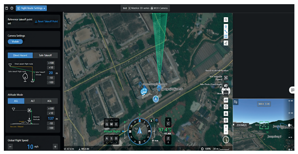
Figure 2. Flight path library [based on the authors' own editing]

required. If you want to use a static IP, you will need to configure it separately. To ensure the safety of the docking flight test, the remote control can be used to manually take control of the aircraft during flight after connecting to the aircraft as a B controller. After configuring the dock and the drone, the next step is cloud management. The first action is to create a flight plan using the Flight Route Library icon (Figure 2). In this menu, you can enter the flight route editor, set the route parameters and plan the flight route. After the route design, we can create a new task by clicking on the Task plan library icon. In this menu, we can link the created flight plan to a planned task and choose the selected dock, which will be assigned to execute the planned task based on the pre-planned flight paths. You can also set the timer for the plan and the Return to Home (RTH) altitude relative to the dock, and finally click OK to complete the new flight plan. Through the cloud management, you can access the maintenance interface, where you can view live and storage data of the dock and its associated drone, as well as debugging.