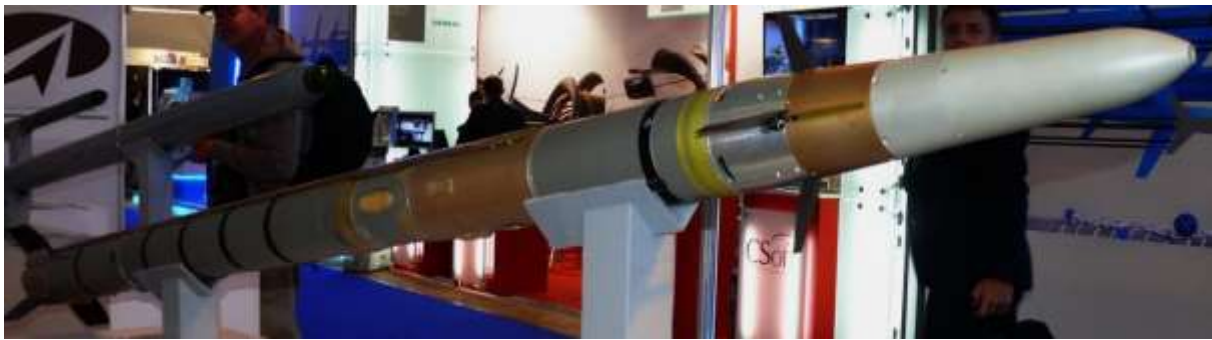
Pic. 1. 9A4172 "Vikhr-M" missile [3]

When the first good photographs appeared they led to still more confusion: There was no visible seeker (causing some analysts to believe it to be an unguided rocket system)." [9] See picture 1.