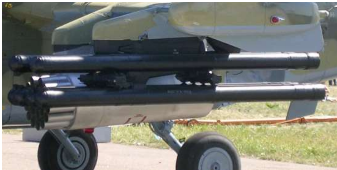
Fig. 2 Launcher APU-6 [9]

Storage, transportation and launching are to be carried out in transport and launch containers, providing warehousing without maintenance up to 10 years.