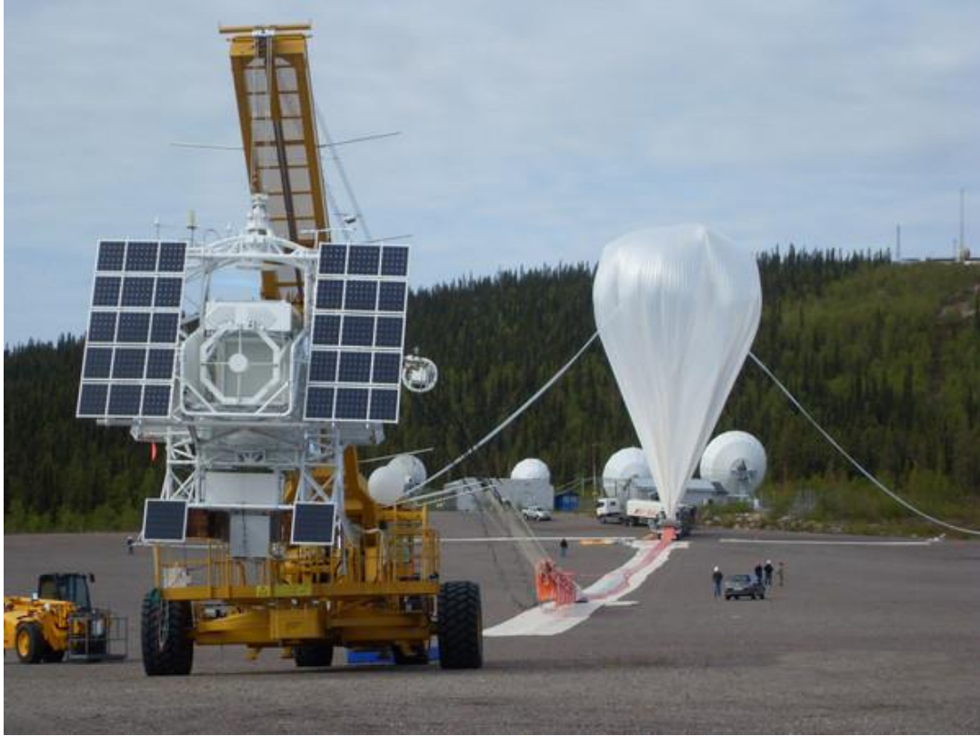
Picture 4. Stratospheric balloon of Raeven Aerostars with communication relay [13]

to take on position them. If the wind blow it, the system float the balloon higher or lower, in order to arrive in an opposite wind direction, so it can be again on a good position. This project made a serious skepticism in professional circles, and also in the company Google-because of the name 'Loon'. Besides this opinion there is a serious stock invest behind the project [12]. You can find a prototype on the Picture 4.