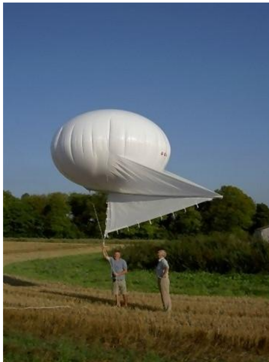
Picture 3. The combination of the balloon and the kite is the helikite [7]

There is a capital difference between the blimps, balloons and the flying vehicles. The aerostats float while the fix and rotary wing aircrafts fly. The tethered and free floating aerostats are differentiated, the tethered balloons are usually employed in low altitude (30 m-5 km), while the free floating aerostats can lift until tens of kilometers. The helikite is a special hybrid form of the tethered unmanned aerial vehicles. This platform was created from the combination of a helium balloon and a kite to form a single, aerodynamically sound tethered aircraft that exploits both wind and helium for its lift. The balloon is generally oblate-spheroid shaped. The aerodynamic lift resists to the wind and allows even small helikites to fly at low and medium altitudes in strong winds that push simple balloons to the ground. The helikite was designed and patented by Sandy Allsopp in England in 1993 [1; pp. 22-23.]. You can see a helikite on the Picture 3.