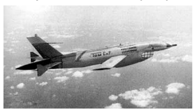
Figure 4. Ryan Model-147 UAV

All together the Ryan Aeronautical made 28 modifications of the Model-147 UAV. The new drones' tasks included day-and-night photographing, electronic detection, jamming, deception and spreading leaflets. The fast reaction was delayed by the fact, that information gathered with this could be analysed after the UAV's return. By 1972 it was even possible to broadcast the data live to the ground station. The Ryan Model 147-SC was equipped with TV camera and datalink system. The Ryan Model 147N could amplify its radar signals, so it was detected as it was a much larger target [13]. From 1972 the UAVs joined the propaganda warfare by spreading leaflets, because the conventional airplanes had suffered serious damage during these missions.