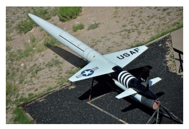
Figure 3. The AQM-35 supersonic target PTA

After the Second World War, researches related to the UAVs continued, which was supported by the big development of automatic systems. In the 1950s with the appearance of aircraft and missiles flying over the speed of sound, the air defense units needed new assets to simulate targets like these. Military leaders wanted to develop pilotless target aircraft with supersonic speed. In 1953 the Radioplane branch of Northrop started working on the AQM-35 supersonic PTA, [Figure 3.] which carried out its first take-off in 1956. It was able to fly as fast as Mach 1.55. Its main task was to help with the training of air defense missile units against supersonic airplanes. Even though it was possible to launch it from the ground, most of the cases it was launched from an airplane, from where it was controlled. All together 25 models was build, but the program was stopped, because the UAV was so fast that the air defense systems couldn't track it, so they were unable to lock on this UAV [13].