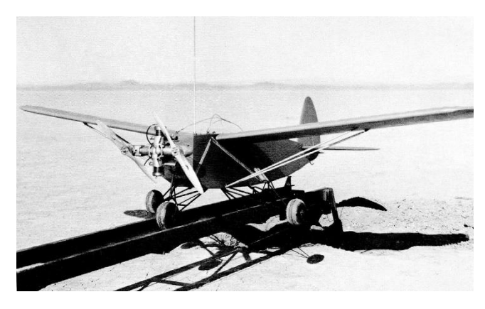
Figure 2. A Radio Plane on the ramp ready for departure

After the outbreak of the Second World War, the militaries' demand for Pilotless Target Vehicles started to grow rapidly. That's why the Radio Plane, [Figure 2] codenamed OQ-2 was created in the US by Reginald Denny. It was a monoplane made of wood and propelled by an aircrew. The UAV could land with the help of a parachute if the datalink was lost for some reason, a function that proves it to be a relatively developed model. Furthermore it was able to take off from its landing gears on an ordinary runway. In contrast with the earlier UAVs, damaging could be avoided because of these features.