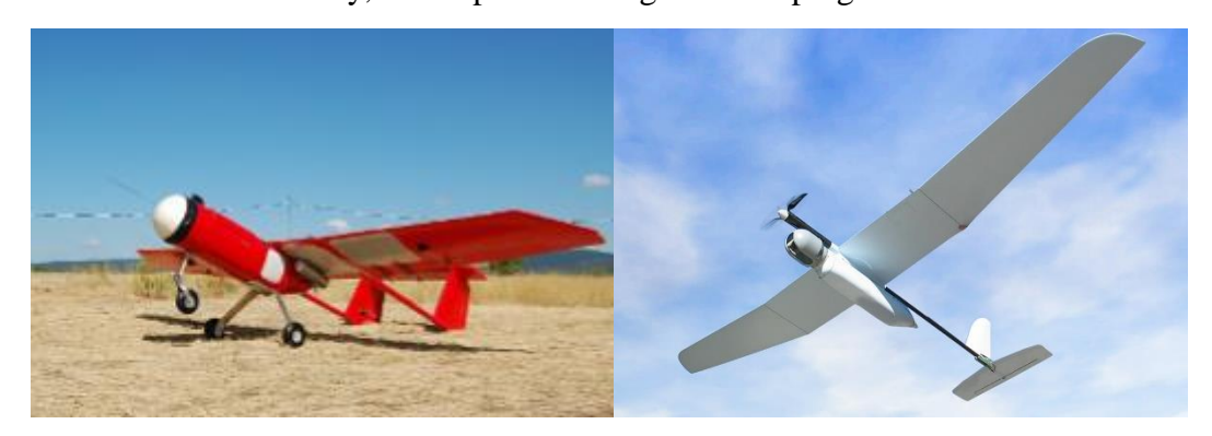
Figure 8-9. the Meteor-3 ready for departure and an airborne Skylark

This article would not be complete without briefly mentioning the Hungarian UAV developments and researches. The Meteor PTA family has been produced for Hungarian Defense Forces since 1999 by the Aero-Target Bt. These UAVs are used mainly to train the air defense units' personnel, on the practice missile shootings. The first product was the Meteor-1 in the series. In 2005 the company won the competition to modernize the existing PTAs. The Meteor-3 [figure 8.] made it possible to provide cheap and fully Hungarian target material for the users. This UAV is able to follow a rout automatically. Even though its top speed is only 140 km/h, its duration is 40 minutes and range is 60 km. The Meteor-3 has a payload of 4 kg including fuel, and ceiling of 3000 m. It can carry up to 4 pyrotechnic cartridges, but can be mounted with radio telemetry too. In addition it can transport a 180 mm Luneberg lens to increase its radar cross section. The 2.7 m wingspan, 1.8 m long and 11kg body is powered by a 30 cm<sup>3</sup> piston engine. It is launched with the help of catapult and it lands on its skids. Unfortunately, its slow speed decreases its credibility, so the producer began developing a faster PTA.