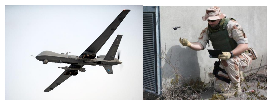
Figure 6-7. A British Reaper operating over Afghanistan in 2009 and a Black Hornet Nano

on the ground with local situational awareness. They are small enough to fit in one hand and weigh just over 16 g, including batteries. An operator can be trained to operate the Black Hornet in as little as 20 minutes. The UAV is equipped with a camera, which gives the operator full-motion video and still images.