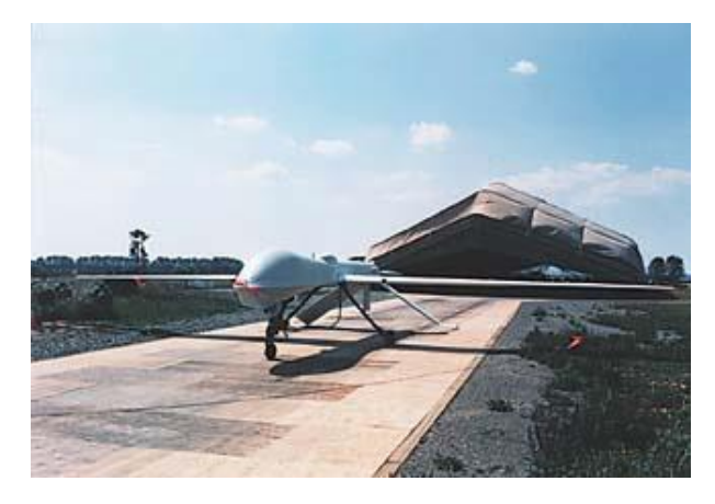
Figure 5. A Predator UAV in Taszár, Hungary, during the Yugoslav War

turned out that drones can be used in many ways in almost every combat theatre, and they are extremely effective [13].