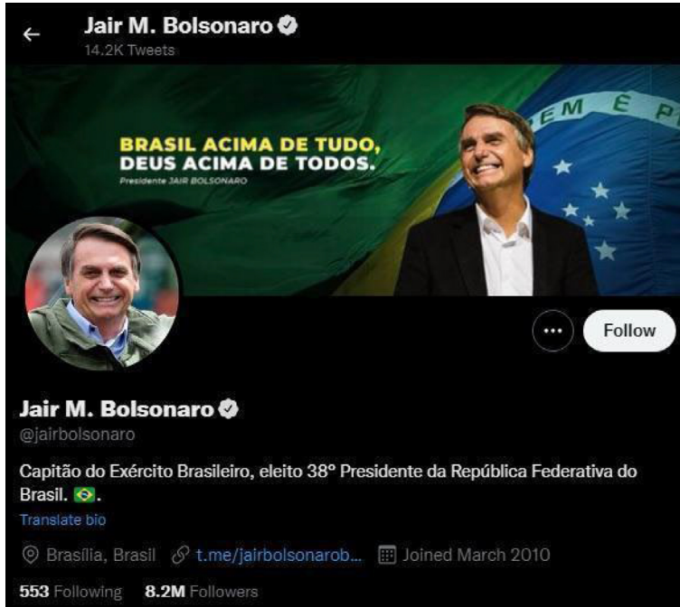
Figure 1: Bolsonaro's Twitter

the influence of the platform in the construction of public opinion, particularly in decisive moments or crises.