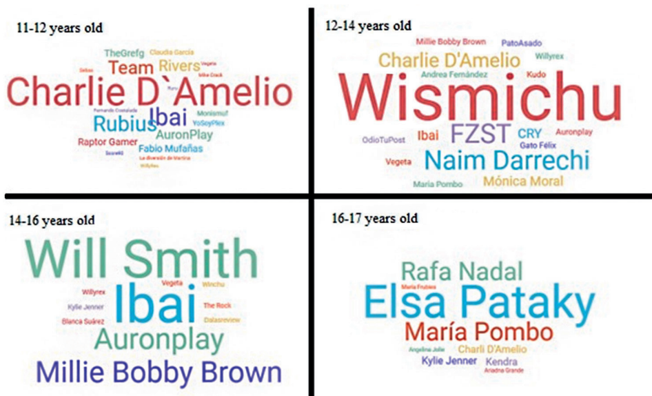
Figure 1: Influencers followed by adolescents by age Source: Compiled by the authors.

Younger adolescents were increasingly drawn to profiles that were more focused on social media and became famous through their online activity, such as Charlie D’Amelio, Rubius, Wismichu and AuronPlay. However, participants between 14 and 16 years old tended to follow individuals who were famous for activities beyond social media, such as singers, athletes and actors, including Elsa Pataky, Rafa Nadal, Millie Bobby Brown and Will Smith. This shift in preferences may be related to the fact that adolescents between 11 and 14 expected a more intense and personal relationship with social media influencers.