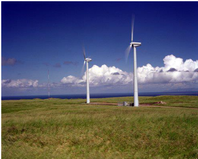
Figure 2: Wind turbines at a U.S. Navy installation, San Clemente Island, CA. 10 (8)