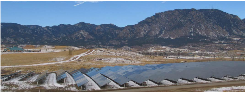
Figure 4: Fort Carson solar array. 11 (9)

According to one formulation the NET-ZERO energy, water and waste is a long and sustainable holistic strategy that is based on the best practices that manages issues connected