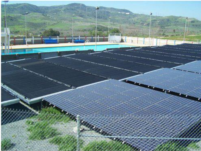
Figure 1: Solar pool heating system and solar photovoltaic system at Camp Pendleton, CA. 10 (8)