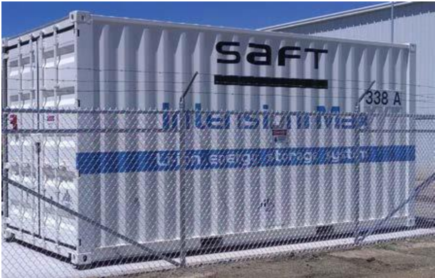
Figure 3: The large battery storage system at Fort Hunter Liggett. 10 (9)