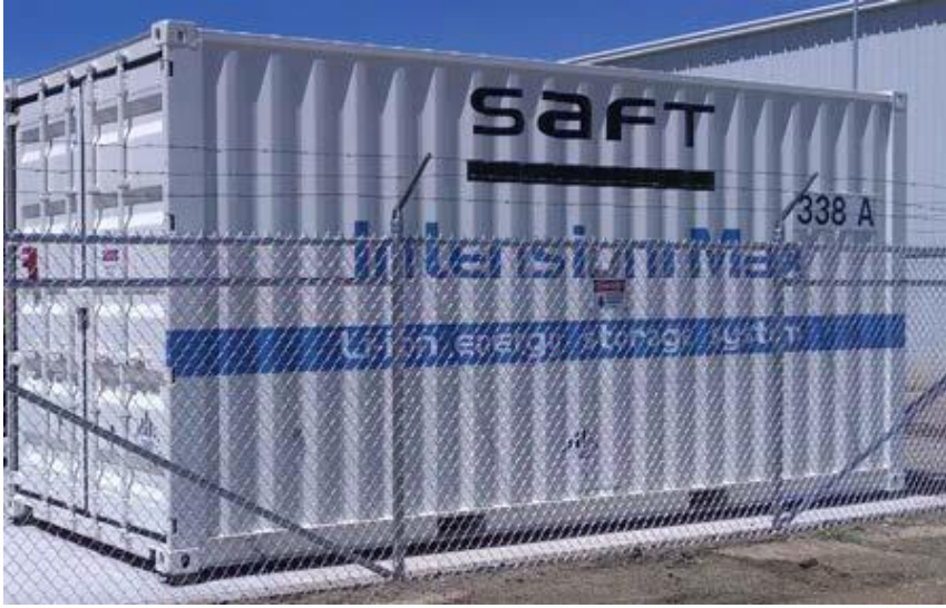
Figure 3: The large battery storage system at Fort Hunter Liggett. 11 (9)