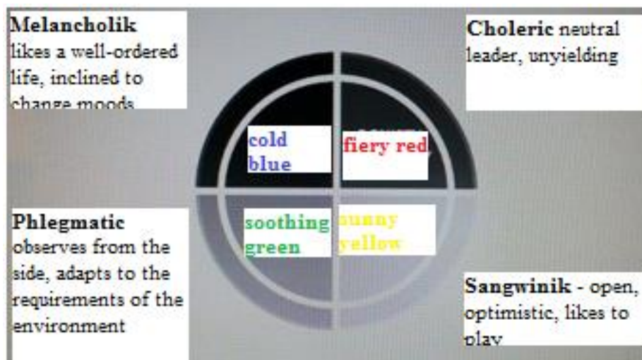
Picture 2. Four types of personality according to Hippocrates

Another factor that strongly influences human performance and decision-making is stress. A condition that contributes to the improvement of human resistance to stress is to have good health. Aviation is a field where special attention is paid to the state of health. This not only applies to new employees but also to those who already have their aviation duties. The health of the aviator is constantly monitored and staff are periodically monitored. Taking into account the work of an air traffic controller or flight crew, the health of these people can not raise any doubts as to the liability of the occupants. A controller who neglects worsens of his health puts at risk all the people he is responsible for. Depending on the type and cause of poor health, the level of danger increases. The crew must be resistant to work in varying physical conditions, overload, pressure or temperature changes, must act quickly to counter fatigue, and all of these elements, with worsening health, increase the risk of error and dangerous situations. Another way to reduce stress is the classification of personality categories defined by Hippocrates. Classifying a person according to this division allows you to determine how it works or the type of reaction in a given situation.