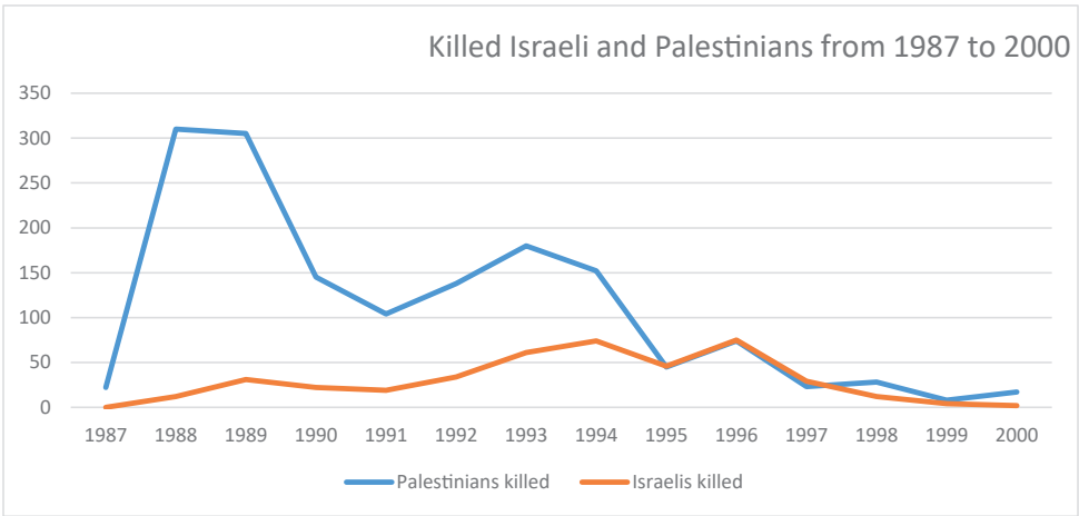
Figure 1: Comparison of fatalities among Israelis and Palestinians

Hamas proved its ability several times to hurt Israel whenever it liked; according to Israeli human rights organisation B’Tselem, Palestinian factions killed about 1,426 Israelis ‘civilians and military’ from 1987 to 1996, and Israelis killed 5,050 Palestinians during the same period (137 Israeli children and 998 Palestinian children, less than 18 years old). 21