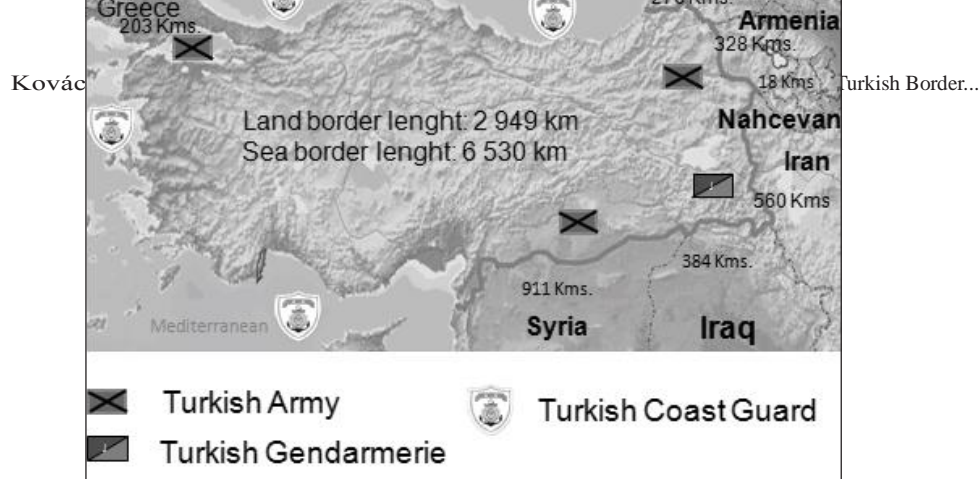
Figure 1. Turkish Borders and Responsible Organizations in Border Protection