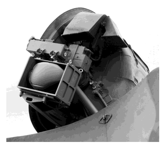
Picture 7. Hungarian Army 1S91 Straight Flush illuminator and optical tracker. [1: 53]