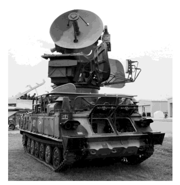
Picture 5. Hungarian Army 1S91 Straight Flush. A Polish built WZU–2 day/night optical tracker has been retrofitted on the RHS of the illuminator antenna. [1: 51]