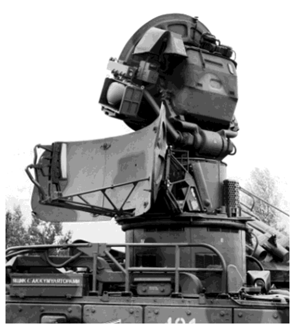
Picture 6. Hungarian Army 1S91 Straight Flush. Note the stacked feeds on the search radar. [1: 52]