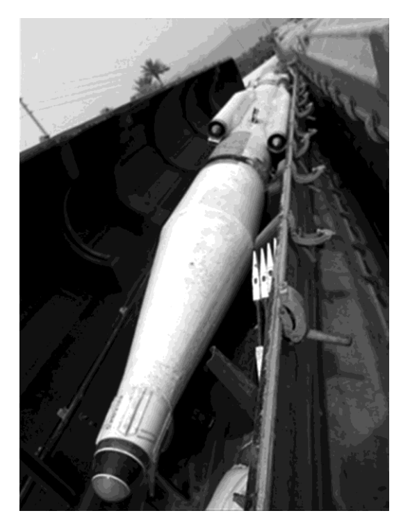
Picture 1. A captured Iraqi 3M9/R–60 hybrid heat seeking Gainful round can be seen. Note the Magnesium Fluoride nose window and ad hoc removal of the fixed nose strakes. [1: 46]

"While the resulting heat seeking 3M9 round would retain similar susceptibility to flares or more recently, infrared jammers, the missile engagement sequence would be devoid of the CW<sup>3</sup> illumination for the terminal phase of the missile's flight. As a result, the aircraft under attack would only have the command uplink signals and terminal phase 1S91 tracking signals to warn of an approaching missile. Where the defensive countermeasures suite relies on the CW signal to trigger angle/Range jamming, the heat seeking 3M9 could be potentially very effective." [1: 45]