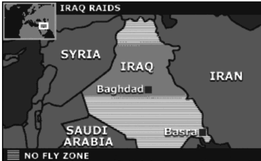
Figure 2. No-fly zone in Iraq between 1990 until 2003. [33]

Another main catalyst that helped keep the region on the boiling is the Iraqi invasion. On 2 nd August, 1990 Iraq invaded its neighboring country Kuwait, as was a result of disputes about oil production. This led to the UN sanctioned international coalition led by the USA, who used ground, maritime and air forces to force Iraqi troops to leave Kuwait. Within days the Iraqi forces were forced out. [1] However, the sanctions never came to an end even after the ceasefire. A no-fly zone was inflicted until the second invasion of Iraq. (See Figure 2.) This no-fly zone helped empower the Kurds in the north and empower the Shia in the south. After the termination of the Saddam Regime through the Iraq invasion in 2003, a new weak Shia regime was established. Hence the weak government and system lived at the tensions that led to failed statehood facilitated internal conflicts, especially with the existence of three different parties (Shia, Sunni, Kurds), with different visions and different views of the new Iraq.