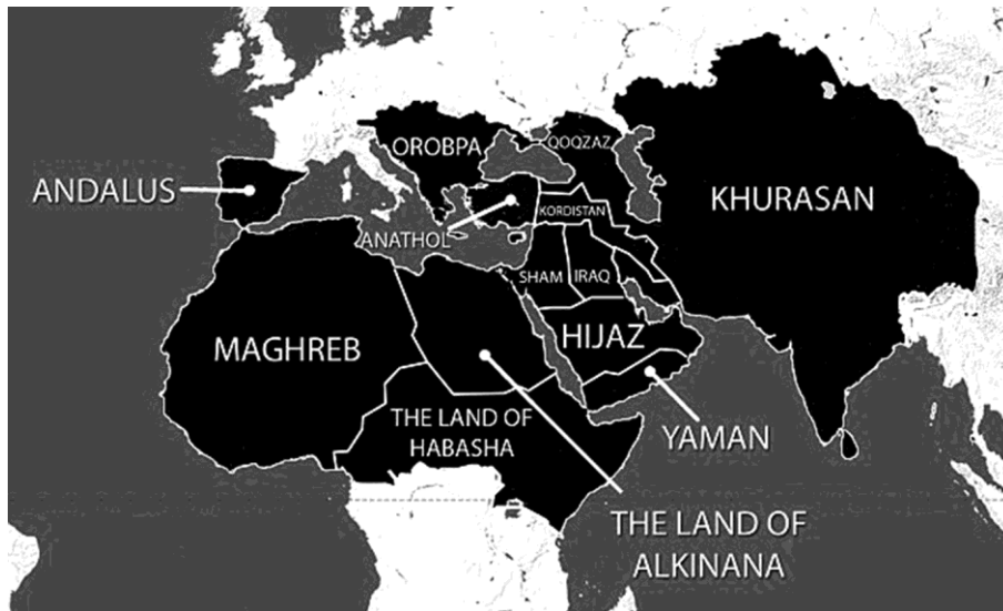
Figure 3. Islamic State according to ISIS. [11]