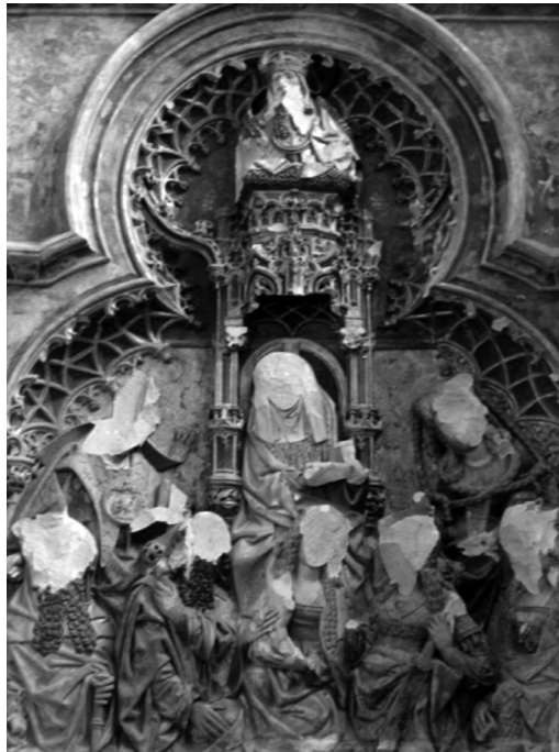
Annex 6. Iconoclasm: Catholic Altar Piece. 4