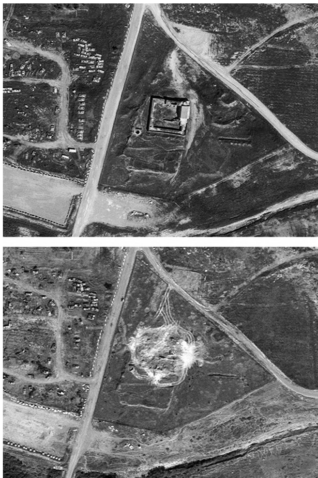
Annex 4. The 1400 years old St. Elijah's monastery in Mosul before and after destruction by ISIS.