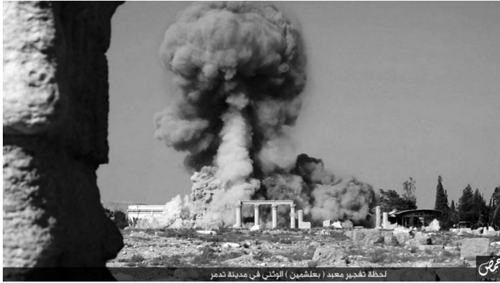
Annex 5. The Temple of Baal Shamin at Palmyra when destroyed by ISIS.