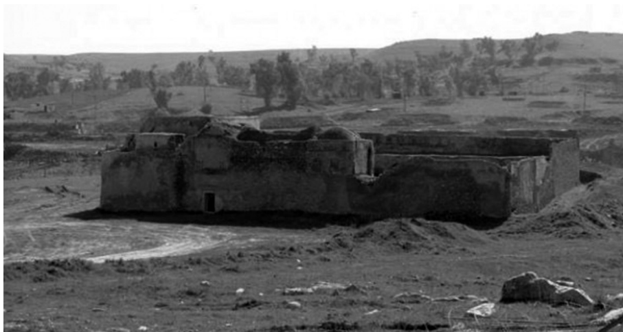
Annex 3. The view of the 1400 years old St. Eliah's monastery in Mosul prior to destruction by ISIS.