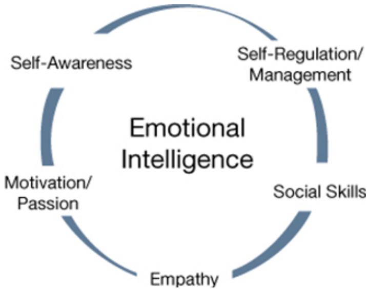
Figure 1. Joint competencies of the leader with vision. [5] [3: 782]

We can see that the issue of leadership effectiveness and responsible behaviour is much more complex and goes beyond whether a person is professionally competent to fill the position. Considering not only the present behaviour and roles, but also the importance of the new leadership competencies of a leader, we can say that leaders being responsible for the organization have to be “leaders with vision”. [3: 782] To meet this expectation such leadership attitude is needed that we can characterize with five basic joint competencies, based on the Goleman-model. [5] (Figure 1)