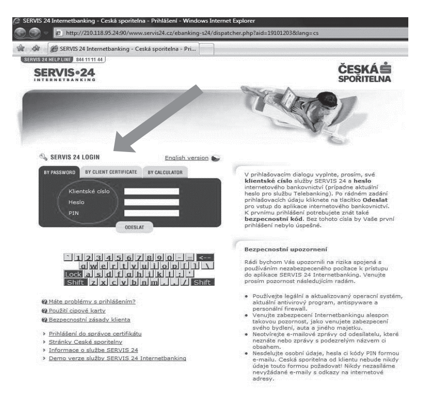
Figure 2. Phishing site requesting the user to fill in their login data, including the PIN number (2009 attack).

This method of coaxing login data and other sensitive information out of the victim is currently on the decline and only rarely used by attackers. The above act can be called phishing "in a strict sense".